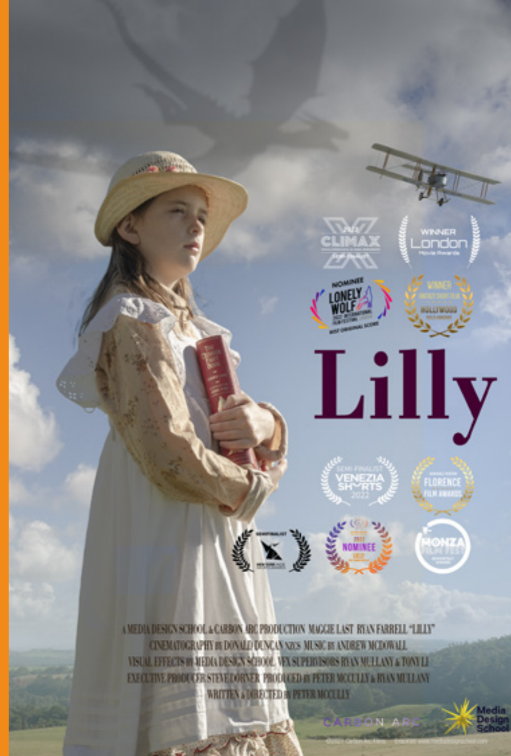
Student work: Pre-productions shots taken from 'Lily student film